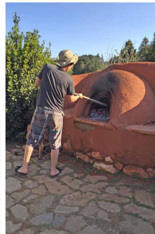
Pizza straight from the oven