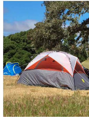
Firewood gathering at the Family Campout