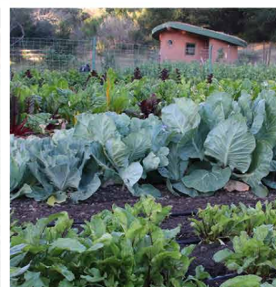
Loving hands brought gardens to life.