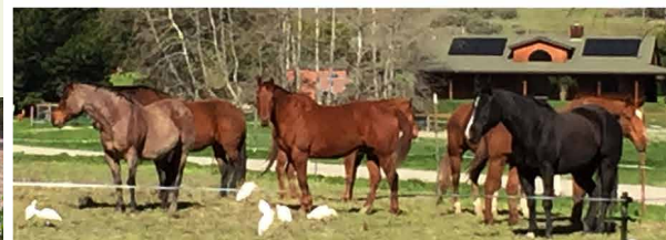
Egrets visit the horses